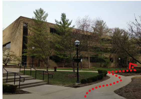
• coming out of CVC atrium