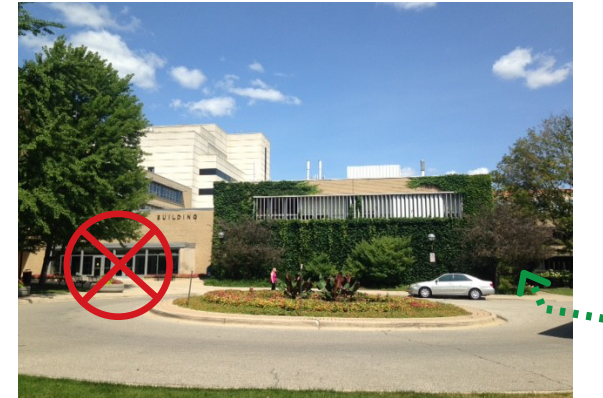
••••• coming from Catherine St./Ann St.